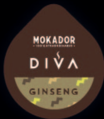
GINSENG tasty and aromatic