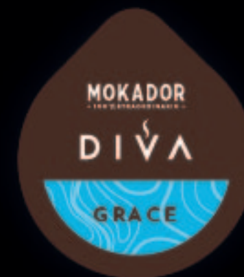
GRACE light and aromatic