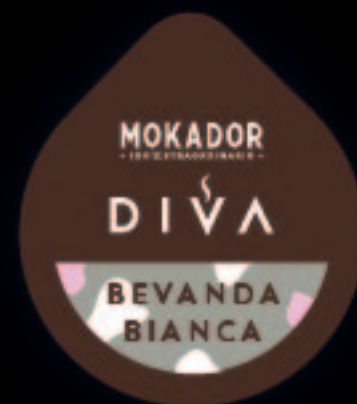
COFFEE WHITENER creamy and delicate