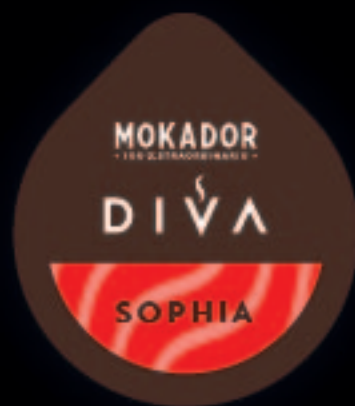
SOPHIA aromatic and velvety