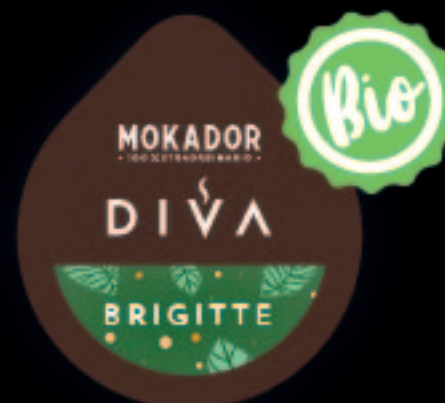
BRIGITTE delicate and fruity