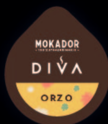
BARLEY light and natural