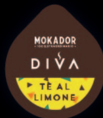
LEMON TEA delicate and perfumed