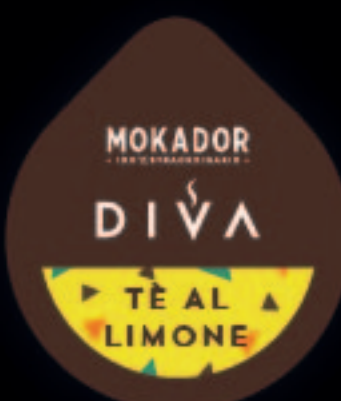
LEMON TEA delicate and perfumed